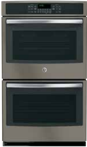
BUILT-IN DOUBLE WALL OVENS*