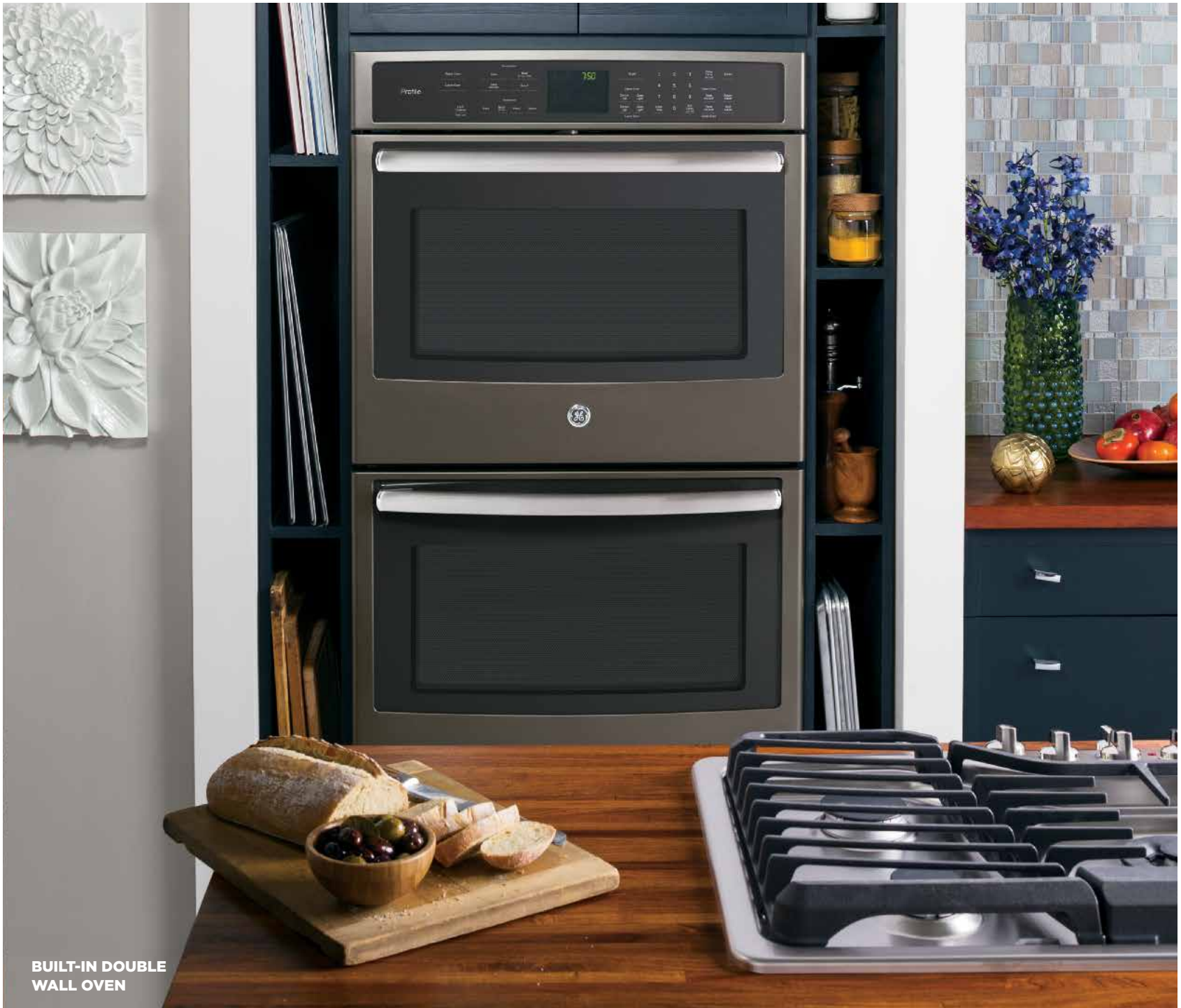
BUILT-IN DOUBLE WALL OVEN