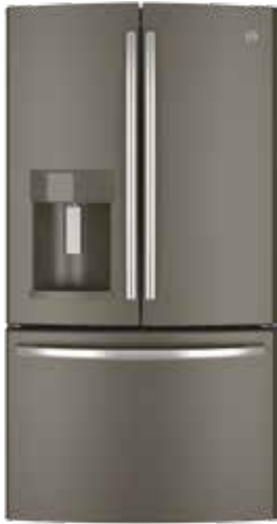
FRENCH-DOOR WITH ICE AND WATER DISPENSER