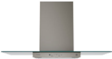
GLASS CANOPY CHIMNEY HOODS*