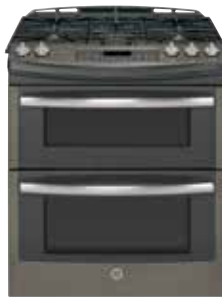
GAS SLIDE-IN DOUBLE OVEN*