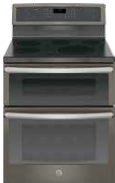
ELECTRIC DOUBLE OVEN