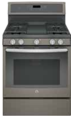
GAS SINGLE OVEN