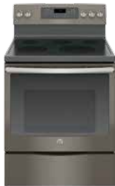
ELECTRIC SINGLE OVEN