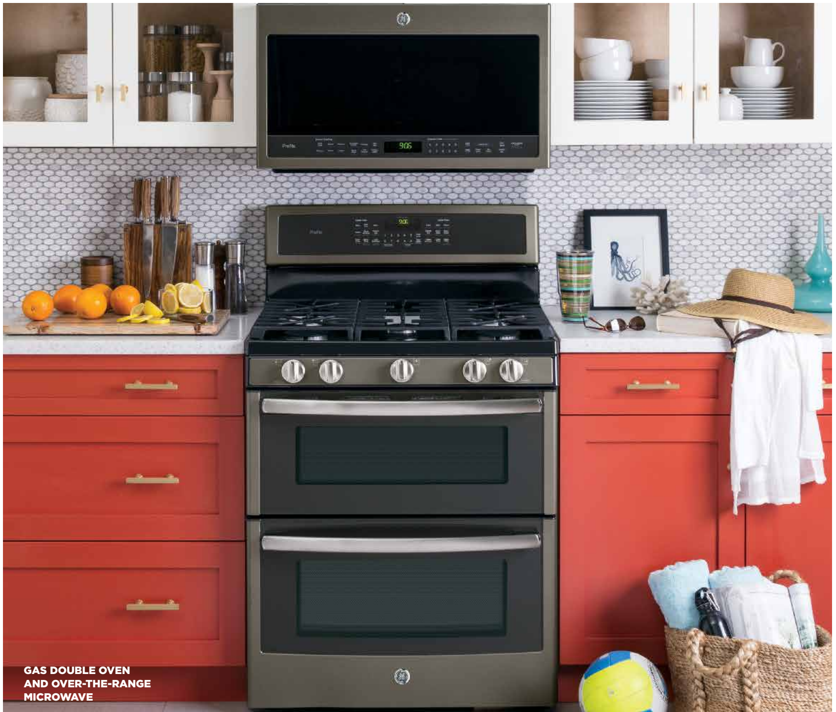
GAS DOUBLE OVEN AND OVER-THE-RANGE MICROWAVE