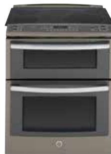
ELECTRIC SLIDE-IN DOUBLE OVEN*