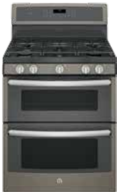
GAS DOUBLE OVEN