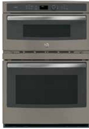
COMBINATION DOUBLE WALL OVEN*