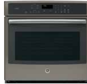
BUILT-IN SINGLE WALL OVENS*