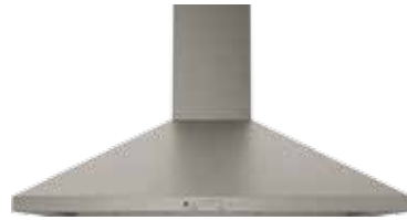
PYRAMID CHIMNEY HOODS*