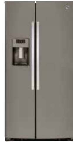
SIDE-BY-SIDE WITH ICE AND WATER DISPENSER