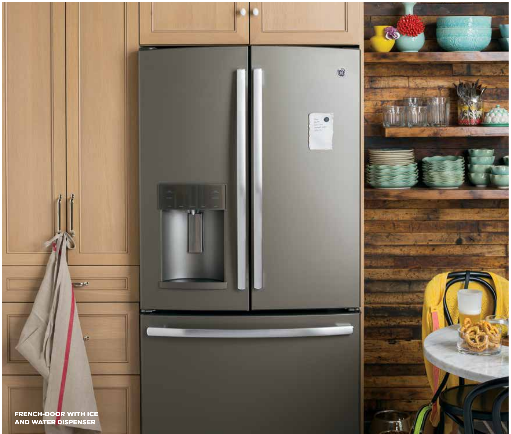
FRENCH-DOOR WITH ICE AND WATER DISPENSER