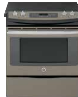
ELECTRIC SLIDE-IN SINGLE OVEN*