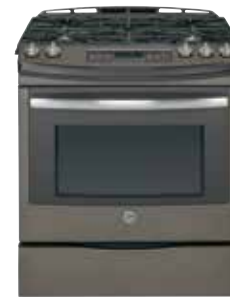
GAS SLIDE-IN SINGLE OVEN*